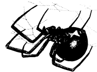
black widow spider

When removing spiders, don't overlook the fact that spiders eat a large number and variety of nuisance and pest insects. Spiders also have natural enemies — wasps, other spiders, birds, reptiles, and others — that sometimes keep them from becoming too numerous.