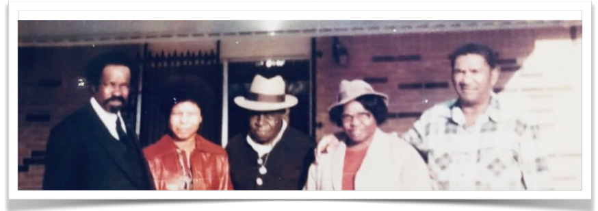
Up That Road, "Red" Papa, Youngest & Big Son.