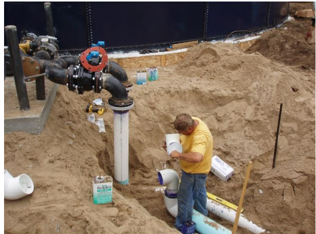
Buried PVC water main, connection