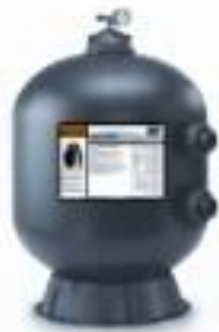
Toro Aqua-Clear Sand Media Filter