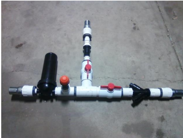
PVC manifold, 2 zones