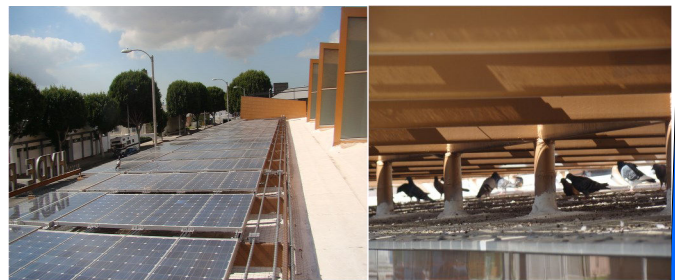
Low Profile electric Flat Track System

Spiders are also made to keep off pigeons and larger birds.