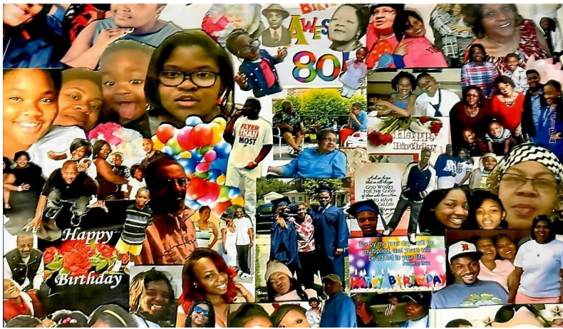
Precious Memories with Family and Friends