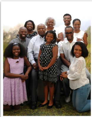
L O V E