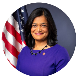
Hon Pramila Jayapal