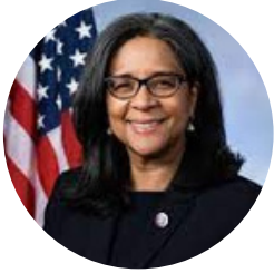
Hon Marilyn Strickland U.S. Congresswoman Washington

Congresswoman Marilyn Strickland proudly represents Washington's 10th Congressional District. Born in Seoul, South Korea, Strickland is the first African American to represent Washington State and the Pacific Northwest at the federal level, and one of the first Korean-American women elected to Congress.