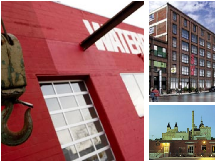
readaptive use - commercial/retail