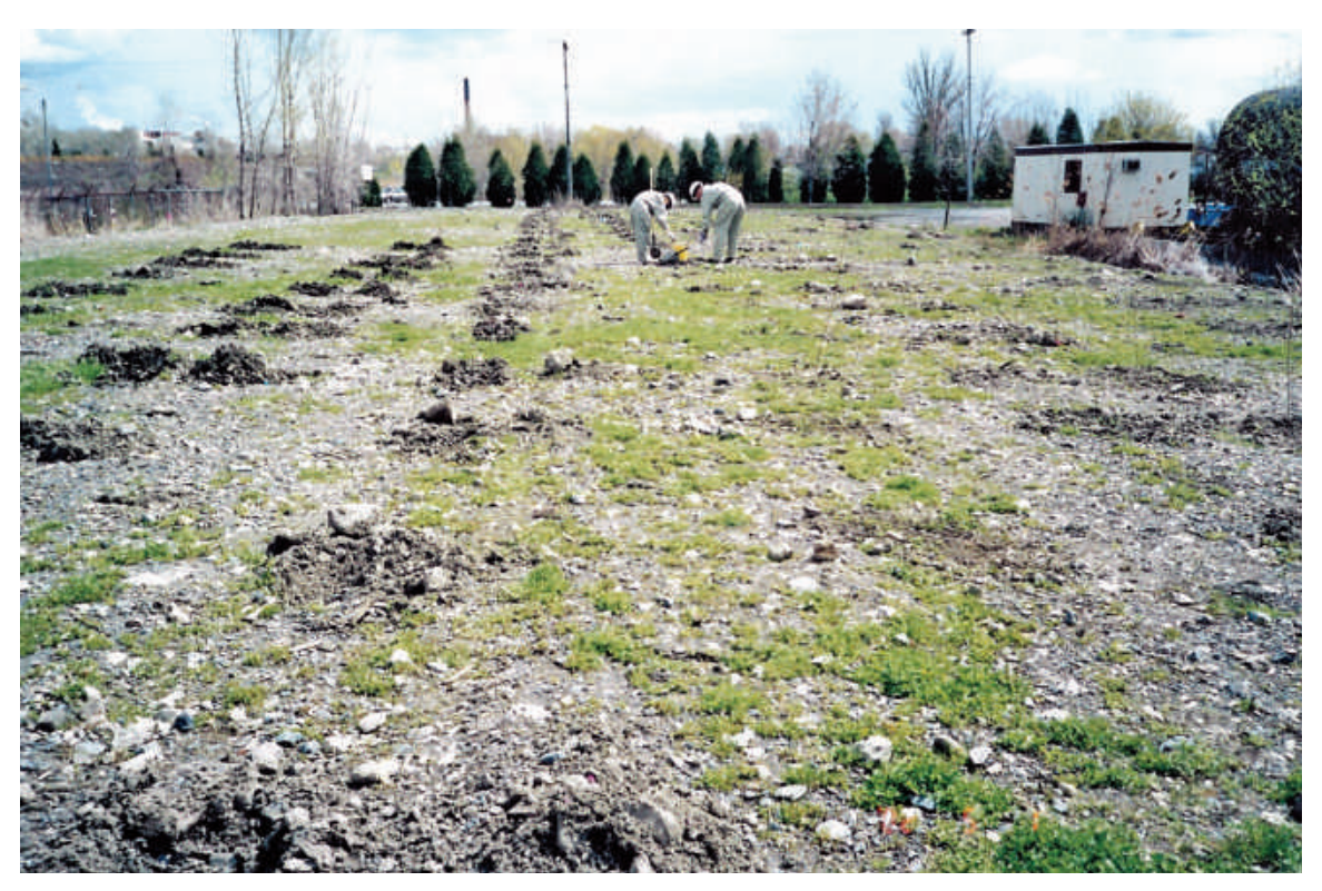
FIGURE 5. Planting rooted hybrid poplars with hand shovels into an anthroposol in holes prepared by a backhoe. Site was seeded with clover in advance, although the initial take is low due to poor soil structure and low inherent fertility.

Overplanting of all vegetation offsets the risks of brownfield-type anthroposols, and in the event that the BMPs below have not adequately addressed risks. For example, poor or patchy fertility will produce irregular and suboptimal growth than can be offset by more individuals. Mortality caused by rodent girdling will be of less consequence if densities are higher. Inadequate vegetation control may be offset by more, smaller individuals. Planting more than one species that provides remediation, for example, hybrid poplars together with hybrid willows, or even more than one poplar or willow clone, will offset ecological risks avoiding the well-known hazards to which monocultures—especially genetically identical clonal monocultures—are prone.