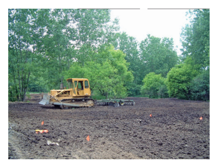
FIGURE 4. Using dozer-drawn harrows on former industrial dump site to prepare for hybrid willow planting.

Phytoremediation depends on healthy plants. Healthy plants are unlikely to be the product in the anthroposols of industrial brownfields. These challenging edaphic conditions must be accounted for and remedied in any treatment design. Approaches to site preparation that promote better plant growth include organic amendments to improve structure and drainage, biochar application to promote increased microbial activity, chemical or natural fertilizers, and agricultural practices such as plowing, discing and or tilling.