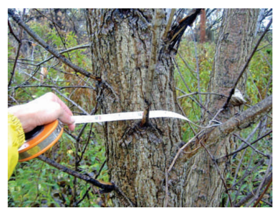
FIGURE 9. Measuring diameter at breast height (DBH) of hybrid poplar with a DBH tape.

Aside from biomass measurements, consider excavation of a representative individual to explore root development, distribution and depth. There is variety of diagnostics that can be determined by a plant pathologist that are helpful in managing the phyto-cover. Excavation may find that roots have not developed to the desired depth, or conversely, may show colonization by beneficial symbiotic mycorrhizae that enhance their growth and remediation capacity. Excavation may also show pathogens or root-boring insects as the cause of mortality, and not phytotoxicity.