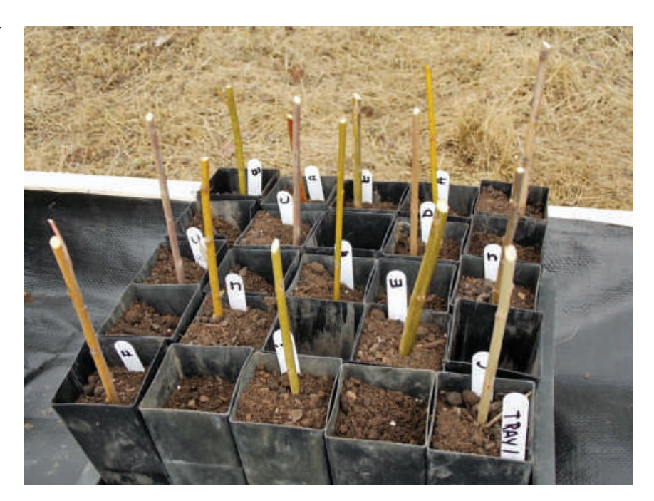
FIGURE 3. Results show no phytotoxicity at 20,000 ppm TPH (total petroleum hydrocarbon) after five months.

FIGURE 2. Set up of blind bench/field trial comparing treatment of and tolerance to petroleum hydrocarbon contamination between different hybrid and native willow clones. The bench/field approach was used to combine the controls of a bench study with containers, in a long term (two year) field setting.