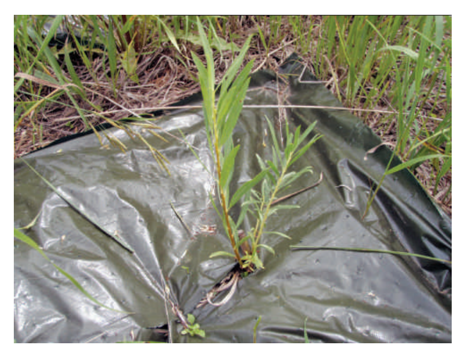
FIGURE 6. Brush blankets smother existing competing vegetation around young trees and exclude new weeds, while letting in precipitation. However, metal staples and plastic adds to onsite waste and removal after year three may be considered.

In the case of smaller installations, removal of weeds by hand or with hand tools is desirable. However, the individual weeding must be able to identify the difference between the weeds and the phytoremediating species.