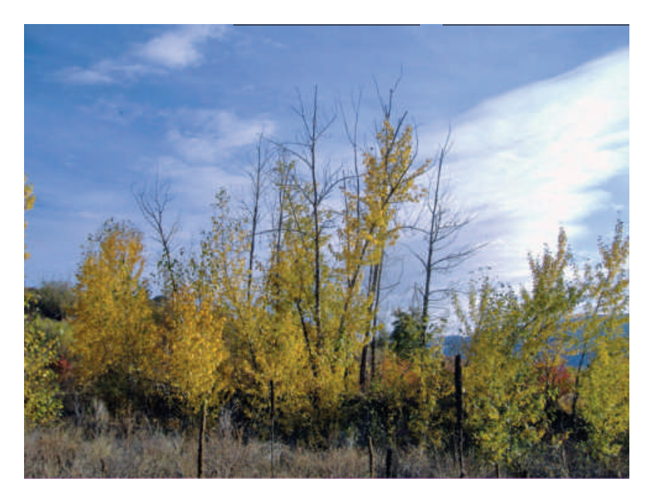
FIGURE 1. These balsam poplars ( Populus balsamifera ) on a closed landfill may be indicating root penetration into the municipal solid waste stratum as indicated by the top dieback.

Dose-response experiments incrementally increase the CoC in the media (water or soil) to demonstrate at what level plant growth is compromised, and therefore its ability to remediate at specific toxicity levels, and what level causes complete mortality. These can be used to compare the site contaminant levels to assess which species, if any, can tolerate and remediate the contaminants on site. Phyto-toxicity levels will vary across plant species for the same CoC.