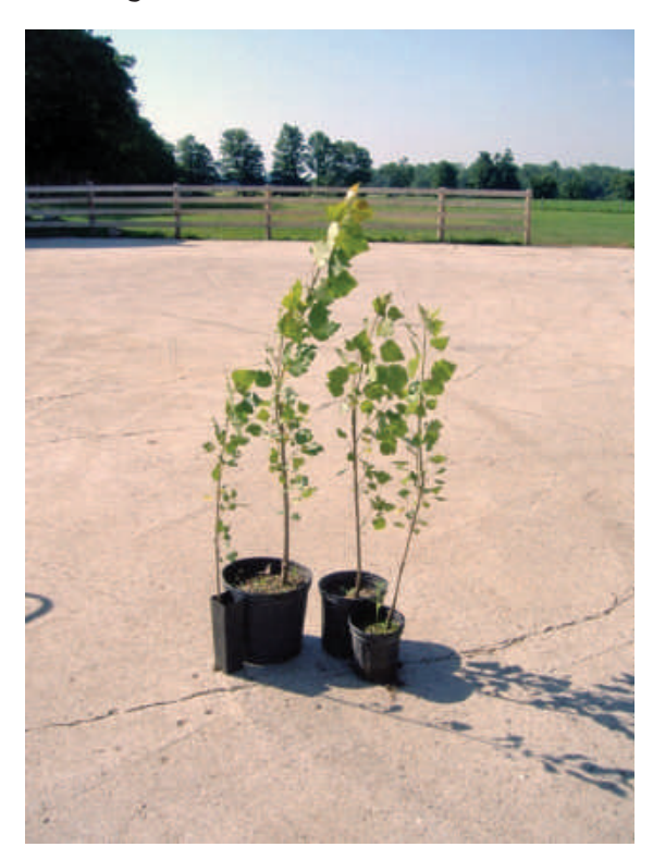
FIGURE 7. Containerized hybrid poplars for installation in early summer to late fall. Larger, mature specimens also have a competitive advantage over weeds.