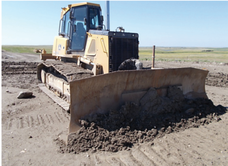
FIGURE 3. Have a plan before land disturbance begins, it’s the law.

When you are hiring a professional consultant or a contractor responsible for implementing a SWPPP, how do you examine whether or not they are indeed qualified? Consider your past 5 partnerships, did you qualify their work for environmental compliance? Was there time in the negotiation process set aside for assessing compliance with environmental rules, how was risk managed? Here are some qualifying questions you may consider integrating with your interview or hiring process: