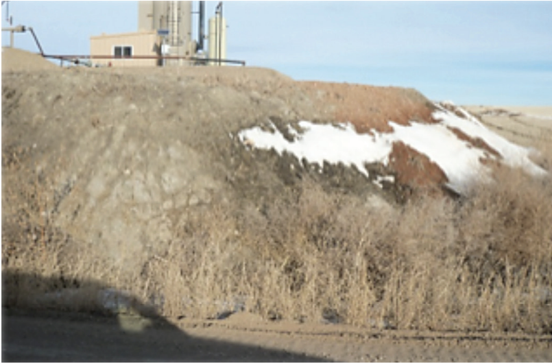
FIGURE 1. Stabilization and cover are important aspects of an effective SWPPP, especially during frozen conditions.