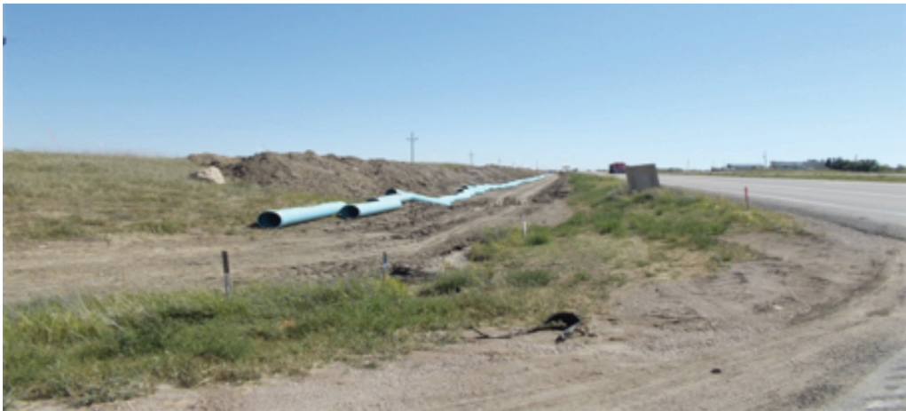
FIGURE 2. Linear projects are often the most difficult to manage; especially perimeter controls.

Did you hear what happened to (fill in the blank with your company name here) ? Last year they pled guilty to six counts of violating the CWA by improperly handling and disposing hazardous materials, pesticides and other materials at several locations throughout the United States and they're required to pay at least $82 million to resolve the violations of federal and state environmental laws. How would it affect your organization and the financial success, if your company name and this title were on the front page of the New York Times, or the Wall Street Journal? While this situation may be a little extreme, the consequences are very real. Consider the negatives of bad press and putting your reputation on the line if you don't carefully manage risk while building your operation.