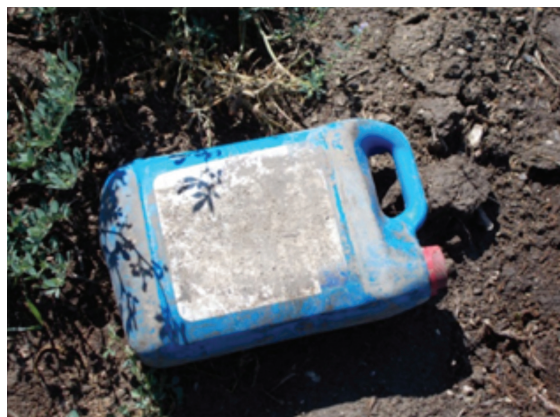
FIGURE 8. Spills, hazardous materials, secondary containment are all crucial pieces in decreasing environmental risk.

Typically, construction projects tend to generate more non-hazardous waste than hazardous waste; however, you should familiarize yourself with the requirements for both types of waste to guarantee proper handling and disposal. Always check with your state agencies for the applicable waste requirements.