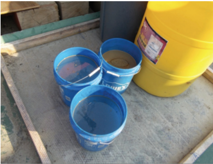
FIGURE 4. An effective SWPPP turns secondary containment measures on a plan to action in the field.

Further, SWPPP's templates are documents that require minimum efforts. These templates certainly are intended for projects that are simple, non-complicated projects which occur with frequency. For projects that are more dynamic, perhaps encounter natural resources; more elaborate and detailed SWPPP's are needed. The following is an excerpt from the Environmental Protection Agency's SWPPP guidance document describing what minimum steps are required to develop a complete SWPPP.