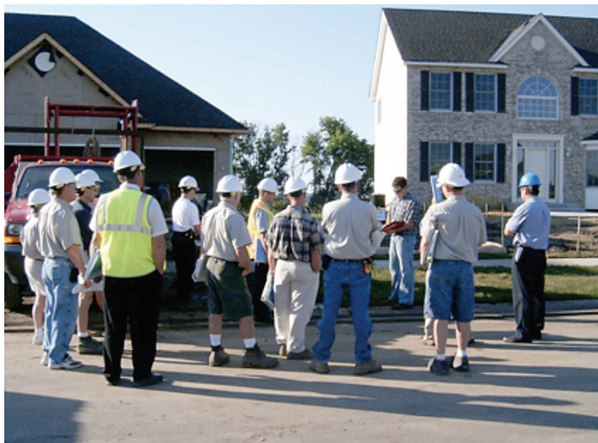
FIGURE 6. Field training is always more effective than office training.

And the same goes for your staff. If you want erosion and sediment controls to be installed properly and maintained on your site, you need to ensure that your chosen contractor has the appropriate knowledge and experience to help you be successful. When possible, provide education and training opportunities for designers, developers and contractors – they also play a big part in managing your environmental compliance risk.