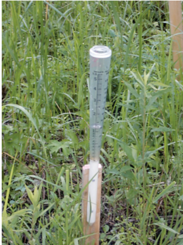
FIGURE 7. Keep track of precipitation on your project and be sure to document it.

Recording inspections is important. The data you record becomes a crucial part of the story your site tells. This reason, along with many legal reasons, is why you record facts – not your opinions. For example, rather than writing down that silt fence needs to be repaired on the southeast corner of the project it would be more efficient to indicate on the inspection form that the current BMP (which happens to be silt fence) used for perimeter control on