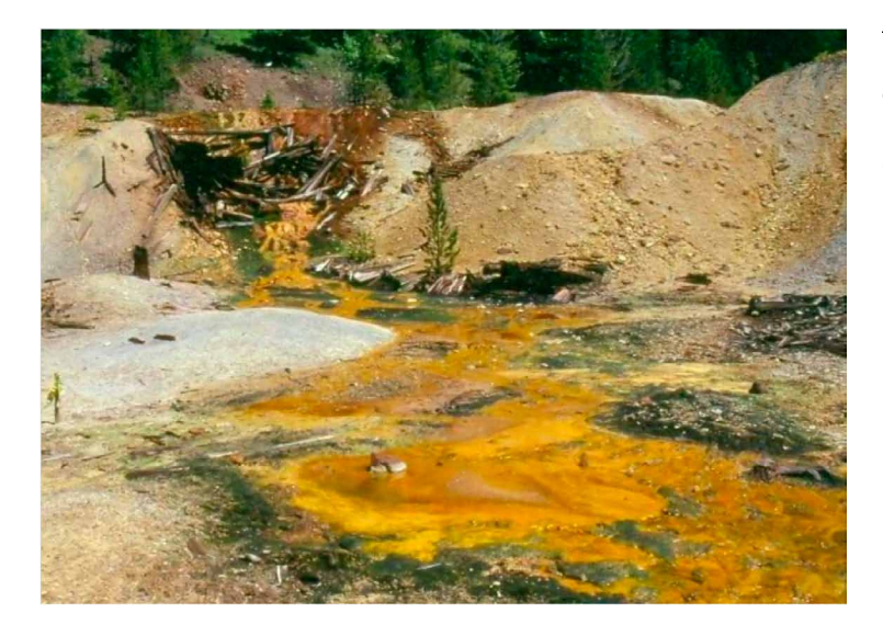
FIGURE 3. Soil surface contamination from rock pile leaching and drainage (deq.mt.gov).

contact with moving water or rain. These solids will be carried by the water and deposited along its flow path. Reactive solids may oxidize when exposed to air and form other products that may be released to the air or water. Prevention and controlled access are required to contain such releases.