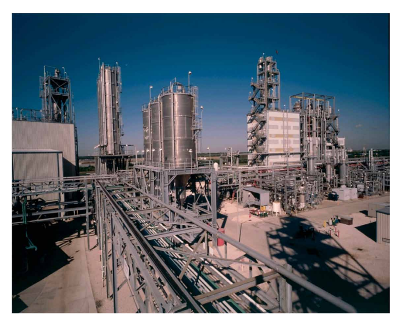
FIGURE 1. Fugitive emissions cannot be seen by the unaided human eye (www.engineerlive. com). Specialized cameras can identify and quantify fugitive releases of several different VOCs (www.irtconsult.com).

There are several types of liquid contaminants. How they will interact with the environment depends on their specific properties. Some of the more important properties are water solubility, volatility, and ability to wet the soil. Other important considerations include viscosity,