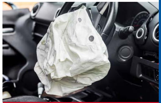
Airbags have saved thousands of lives since it's introduction.

and instantly deflating. Tiny holes in the bag begin releasing gas the moment a driver's head hits the bag, absorbing the impact. This is why the driver's head doesn't hit the bag and then whip backward.