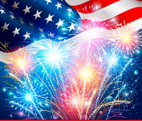
This Independence Day, remember those who made it possible.

Congress didn't actually declare it as legal federal holiday until 1941.