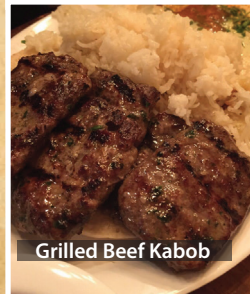
Grilled Beef Kabob