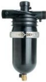
2" Super Filter