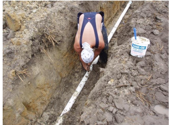
Connecting buried tape to water main