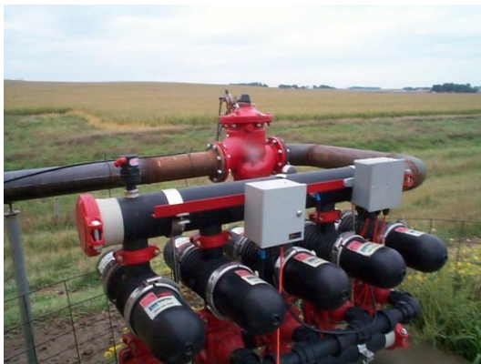
Filtration SDI near Sioux Center, IA