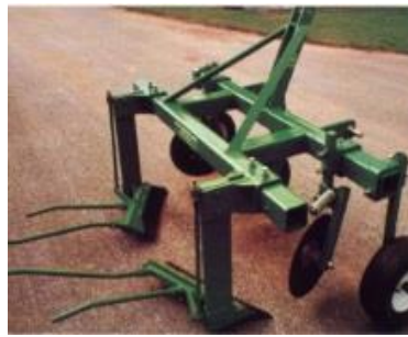
Challenger 1800 Mulch Lifter