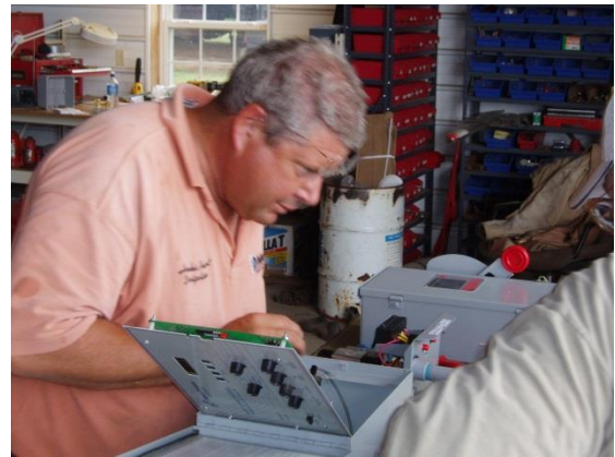
Setting up computer for SDI in Delaware

Subsurface drip irrigation puts a precise amount of water directly in the root zone, increasing water efficiency while reducing energy costs.