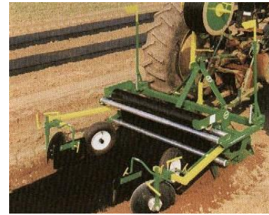
Mulch layer w/drip attachment