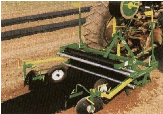
Rain Flo Mulch layer