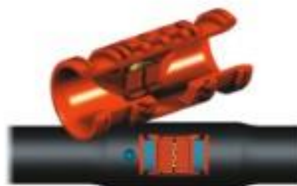
Toro Drip In PC emitter