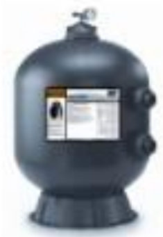
Toro Aqua-Clear Sand Media Filter