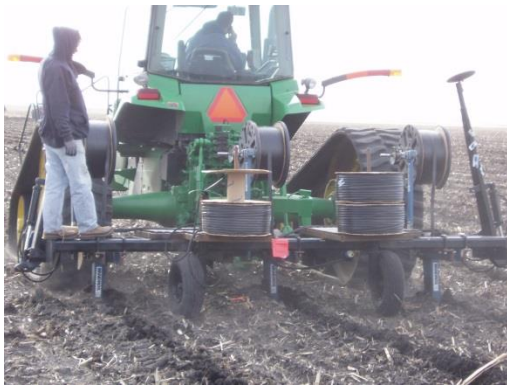
Installation of SDI tape near Mallard, IA

Hook's Point Irrigation has been involved in the drip irrigation industry since 1984. Our first subsurface drip system was installed in 2002 and is still operating. Subsurface drip irrigation systems (SDI) work well in odd shaped fields where conventional systems can't cover the entire area. SDI consists of flexible polyethylene tubing with drippers permanently welded to the inside wall of the tubing. The tubing is typically buried 12" to 18" deep in rows 5' apart. Water filtration, pressure regulation, flushing and monitoring the system is required.