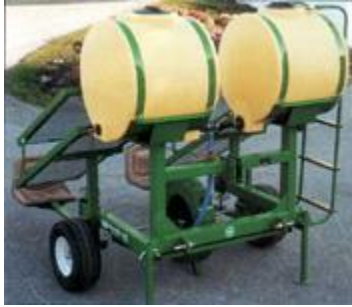
Model 1600 Water Wheel