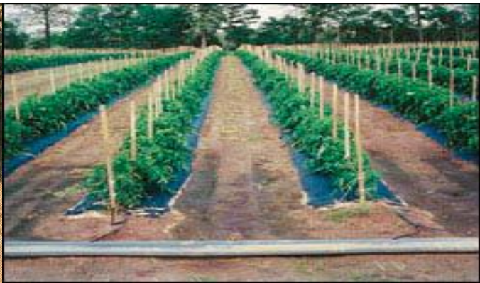
Field of Staked tomatoes on plastic with drip irrigation