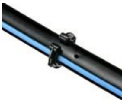
Toro Blue Line PC with Vine Clip