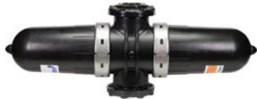
6" Twin Filter