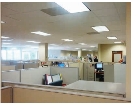
Above: Interior view of the large, open office with cubicles at Doe & Ingalls. Right: The entrance to Doe & Ingalls, part of Thermo Fisher Scientific.

Congratulations to Sola on an outstanding first year!