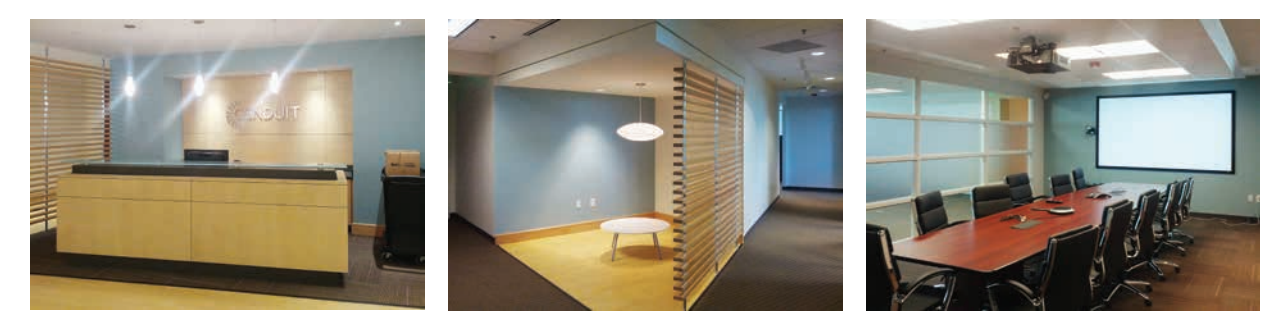
Left: The entrance to Cenduit's corporate headquarters. Center: Seating area with a custom slat wall wood LVT and drywall ceiling with a metal reveal. Right: Cenduit's new boardroom.