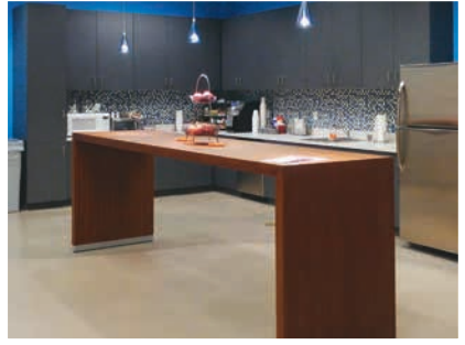
The break room offers plenty of space for staff to satisfy their hunger.

the unique needs of emerging and mid-tier life sciences firms.