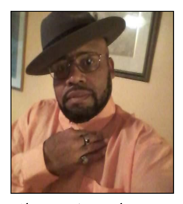
February 11, 1965 ~ October 29, 2019