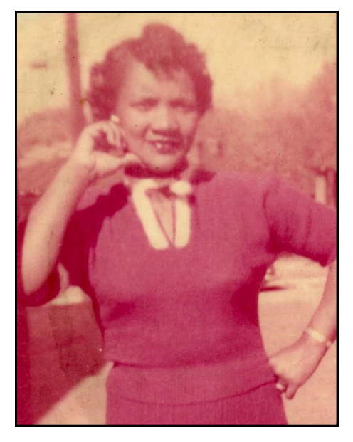
Sunset March 22, 2019