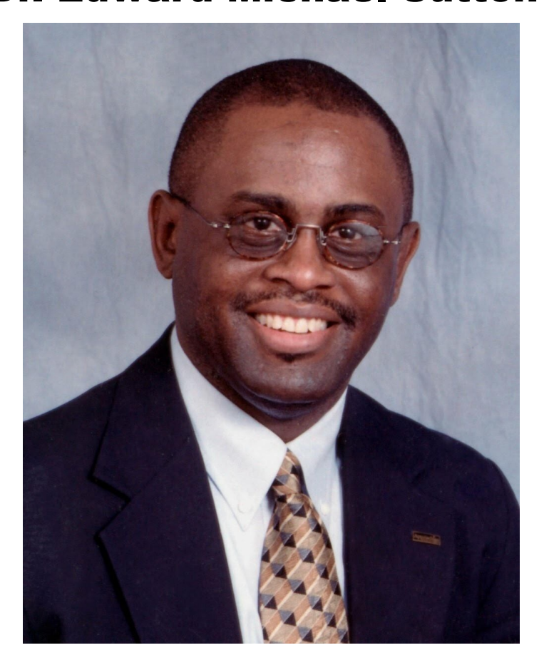
MONDAY, JANUARY 8, 2018 12 NOON

MOUNT ZION BAPTIST CHURCH 950 FILE STREET WINSTON-SALEM, NORTH CAROLINA