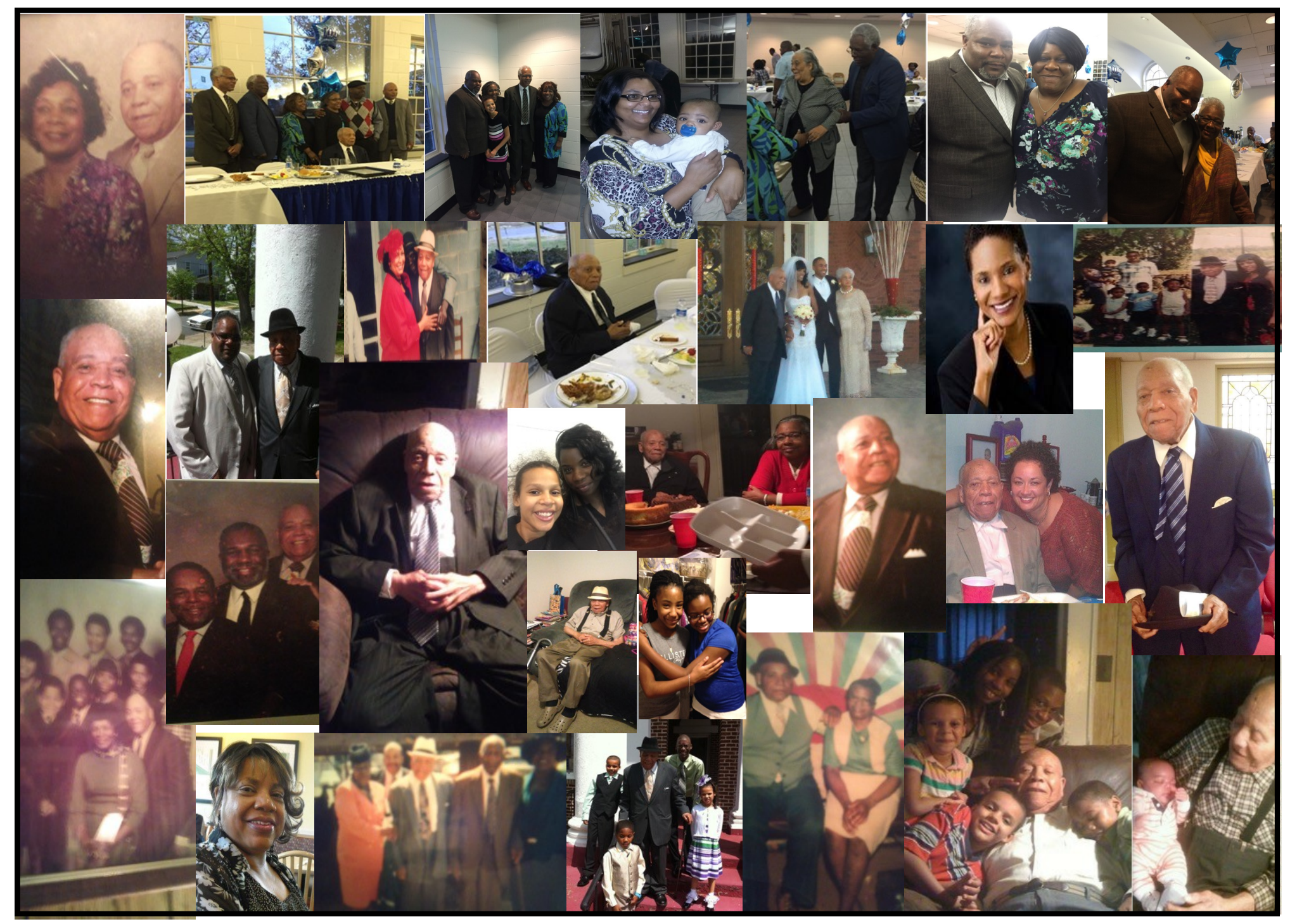
"O God, thou hast taught me from my youth: and hitherto have I declared thy wondrous works. Now also when I am old and grayheaded, O God, forsake me not; until I have shewed thy strength unto this generation, and thy power to every one that is to come." Psalm 71:17-18